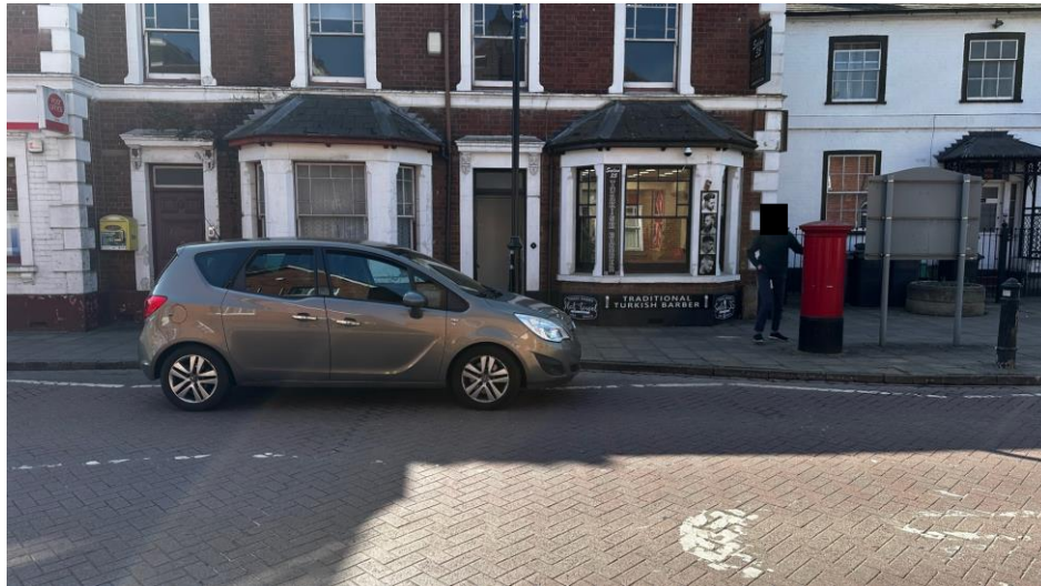
Figure 4.1 – Photograph taken by Parish Council during site visit

Following the committee site visit, a further representation was received from Theale Parish Council, including a photograph taken during the visit (figure 4.1 below):